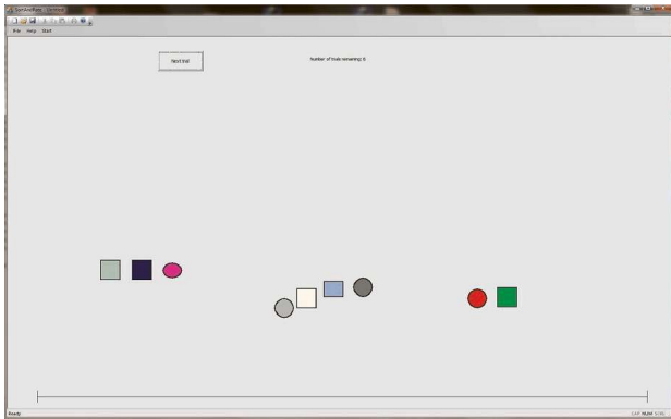
Figure 2. The visual sort-and-rate task. Listeners played each stimulus by clicking an icon, then rated the similarity of the different stimuli by dragging the icons along the line such that more similarity equaled greater proximity.

tions. All reported normal hearing. Two were expert in the assessment of voice quality.